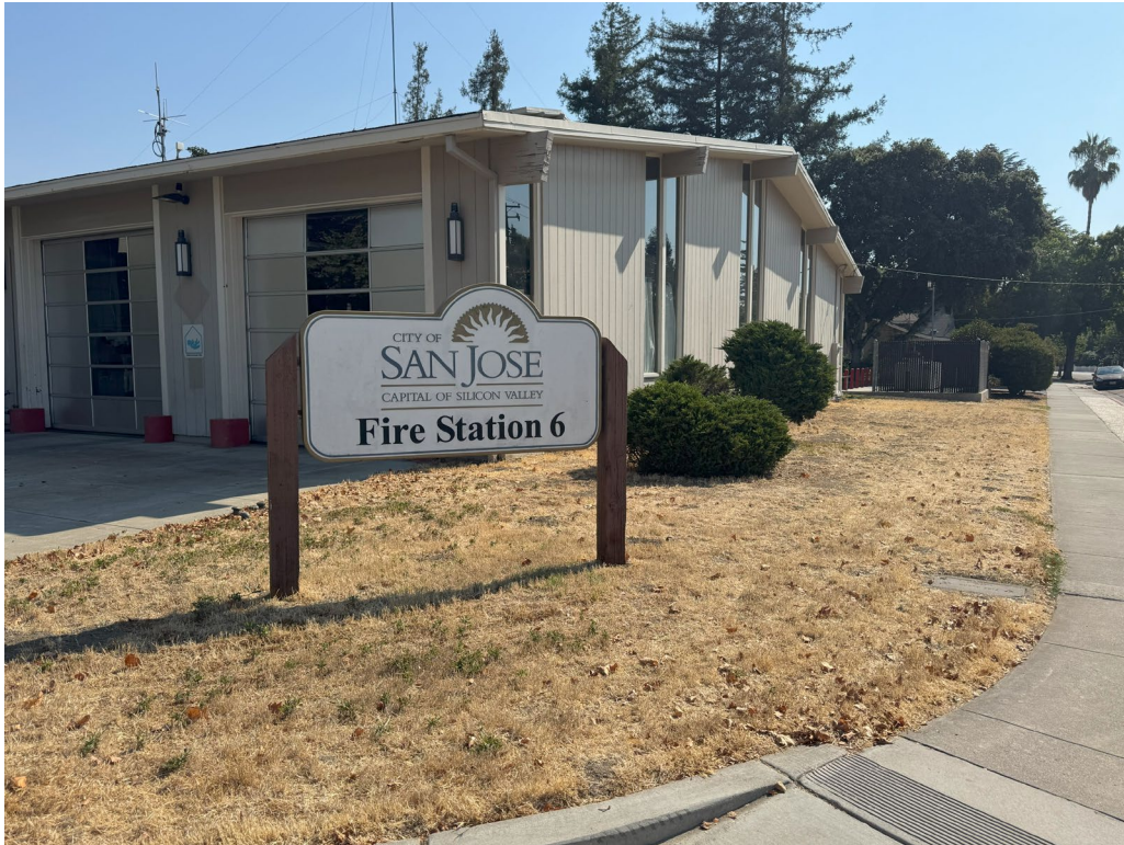
Fire Station 6 Landscaping